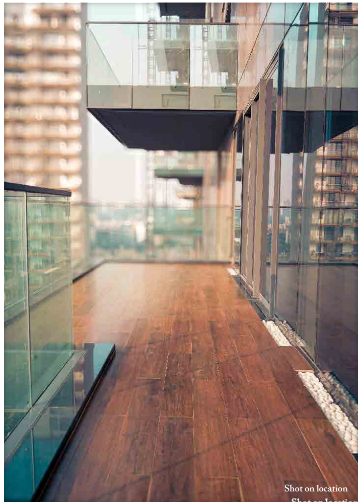
DOUBLE HEIGHT DECK