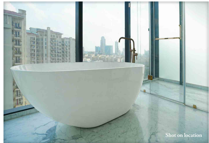
WALLS WITH COMBINATION OF EUROPEAN MARBLE & ACRYLIC EMULSION PAINT