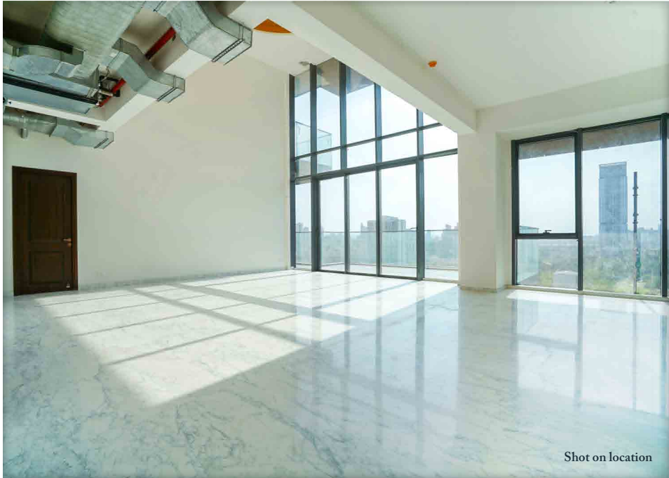
EXPANSIVE LIVING & DINING WITH NATURAL SUNLIGHT