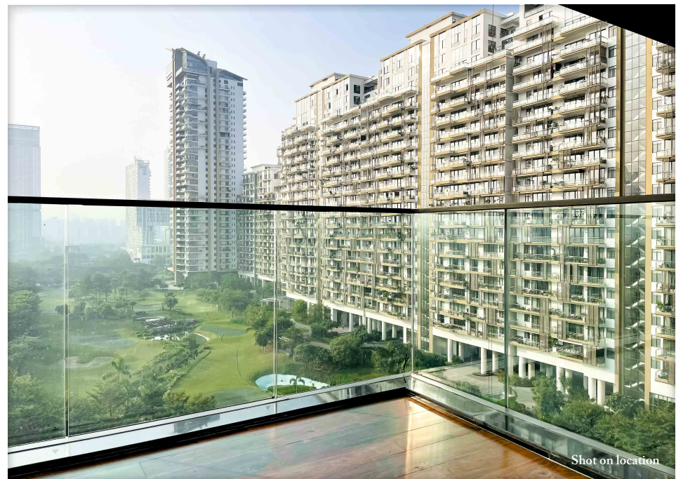
PRIVATE DECK OVERLOOKING GOLF COURSE