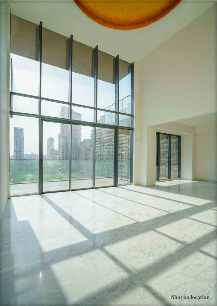
DOUBLE HEIGHT LIVING ROOM WITH EUROPEAN MARBLE FLOORING